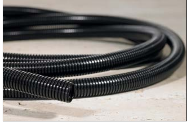
HelaGuard PA6 Light is very flexible and can be used in moving applications.