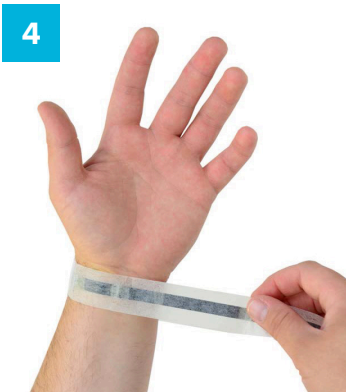
4 Ensure wrist is covered and the black conductive strip is against the skin.