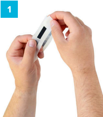
1 Remove wrist strap from external packaging.