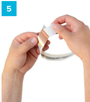
5 Peel back to reveal copper foil layer at the other end.