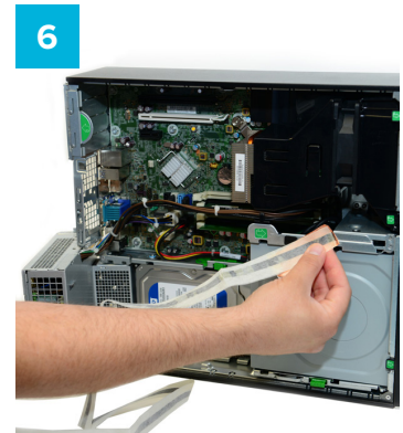
6 Fix the copper foil to your grounding point.