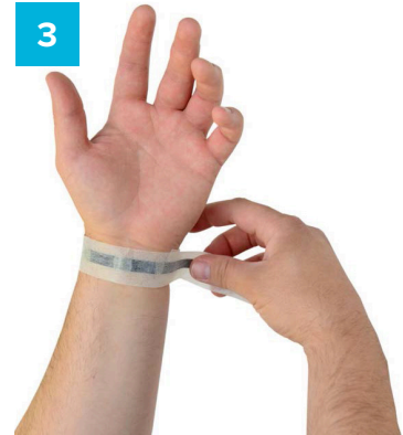
3 Place the tacky side on wrist.