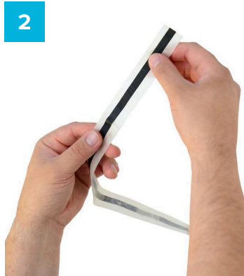
2 Peel back to reveal adhesive layer.