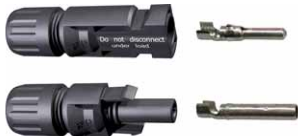
The MC4 plugs and sockets, shown with associated contacts.