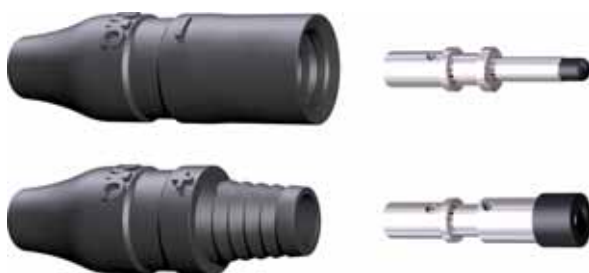
The MC3 plugs and sockets, shown with associated contacts.